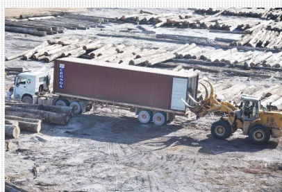
File Photo: Bai Shan Lin's operations in the Kwakwani, Upper Berbice area.

Guyana has been pushing for more value-added operations in the forestry sector but there is little evidence of how serious it is when it comes to monitoring Bai Shan Lin's commitments and deadlines to make it happen.