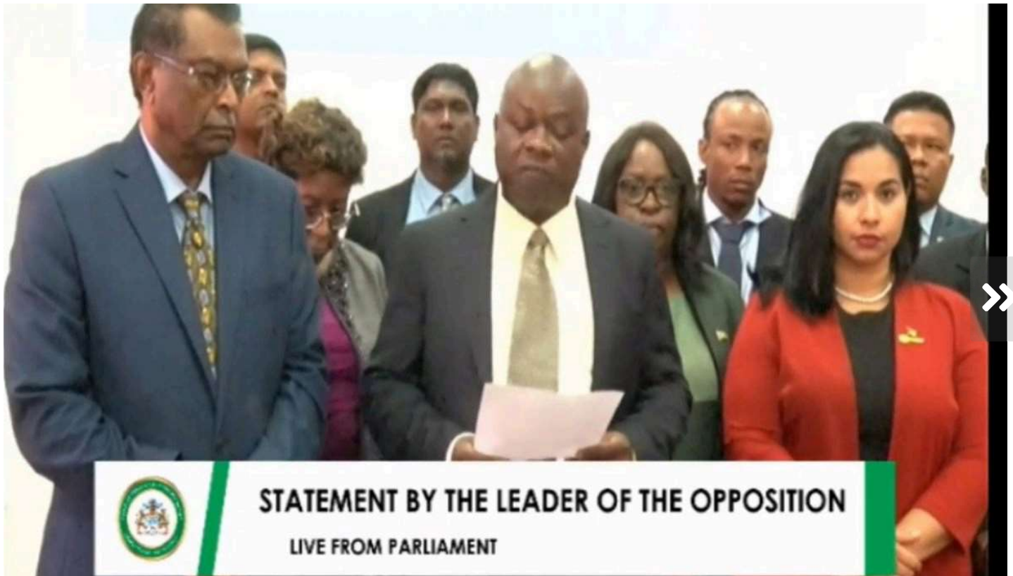
Leader of the Opposition, Aubrey Norton reading a statement today on the walkout.