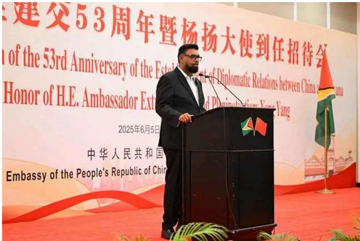
President Dr Mohamed Irfaan Ali