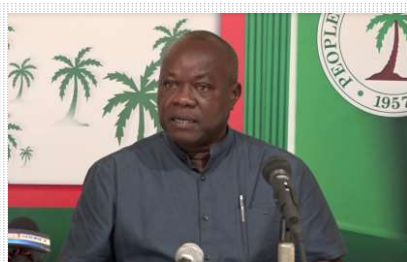
APNU Leader, Aubrey Norton

"We are seeing elements of our manifesto at present in policy initiatives of the People's Progressive Party... (it is) void of ideas, absent of any understanding of how to put together plans and policies. As such, you see no need to put out the census, and as such, you see where you have manifestos and other initiatives coming from political parties, such as the APNU, are easily adopted by the People's progressive Party," he said.