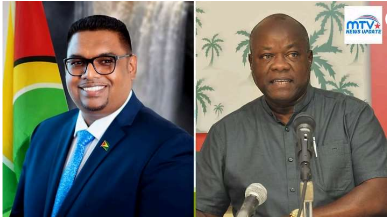
L-R: President Irfaan Ali and Opposition leader Aubrey Norton

Opposition Leader Aubrey Norton and President Irfaan Ali met for the first time approximately two weeks ago and began talks on the appointment of several constitutional bodies, including the Integrity Commission, the Police Service Commission, the Judicial Service Commission, and the Teaching Service Commission, all of which have been expired.