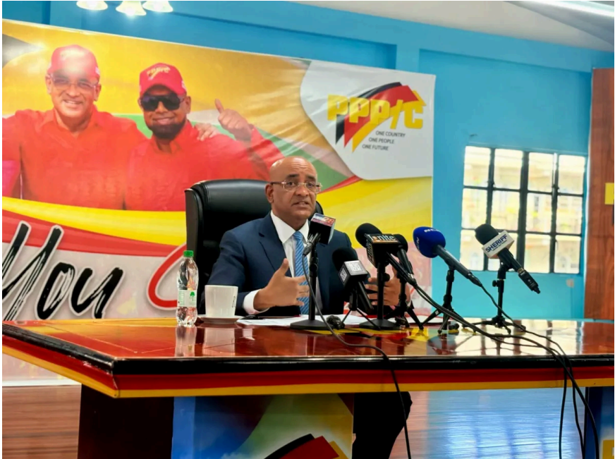
General Secretary of the People's Progressive Party (PPP), Dr Bharrat Jagdeo

While he noted that APNU will continue to "hate" the PPP, Dr Jagdeo suggested that effective opposition requires a more constructive posture, one that balances rivalry with cooperation on matters of national importance.