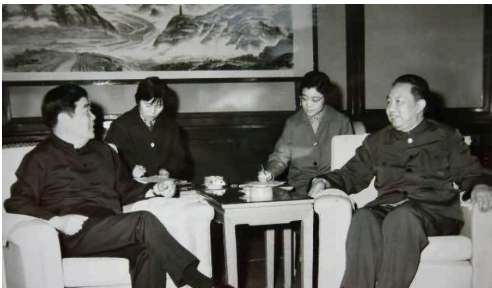
Visit to China by H.E. Raymond Arthur Chung, President of the Co-operative Republic of Guyana, 1977