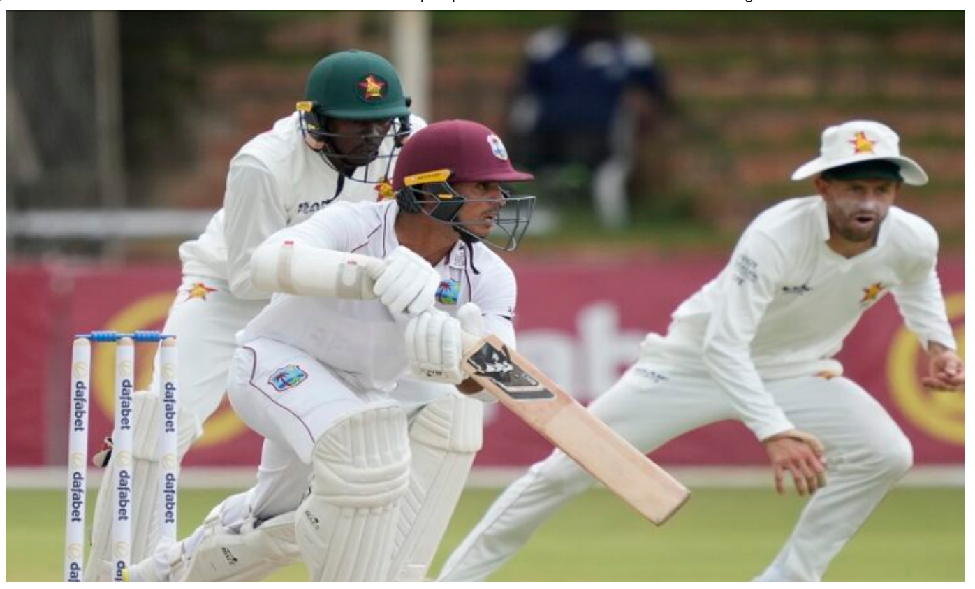
West Indies in control on rain-shortened 1st day vs Zimbabwe