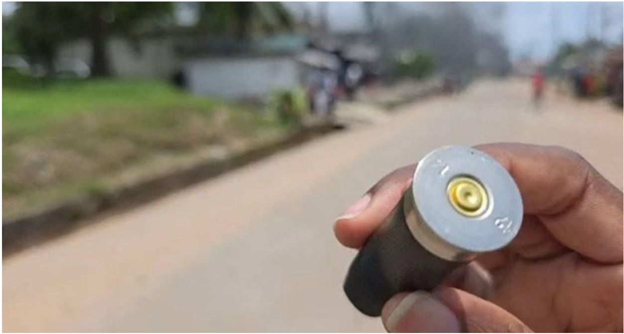
One of the shotgun cartridge recovered by the protestors

Throughout Tuesday, chaotic scenes unfolded as protesters clashed repeatedly with police officers attempting to clear the blockades and restore order. The Guyana Police Force reported that its ranks were met with a barrage of "missiles," including rocks and other projectiles, witnessed by a Stabroek News (SN) reporter, hurled at both officers and police vehicles. Several police vehicles sustained visible damage, including shattered windows and dents. In a dramatic turn, protesters reportedly managed to seize a police riot shield during one skirmish. Amidst the turmoil, reports surfaced of damage occurring at the Mackenzie Hospital, though the extent remains unclear.