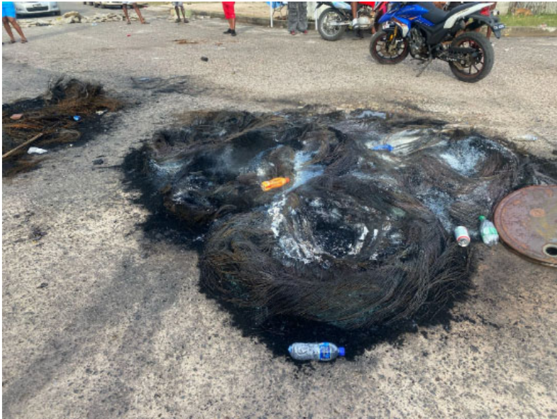
Debris from burnt tyres