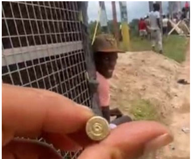
One of the 9mm shells recovered by the protestors

According to this police account, the Sergeant, accompanied by another rank,