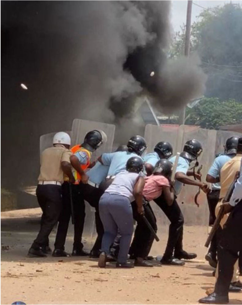
Yesterday morning when the police were advancing to the protestors

with those outcomes.” He emphasized the importance of independent oversight to ensure impartiality.