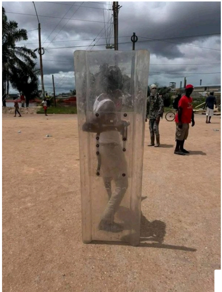
A protester with a police shield