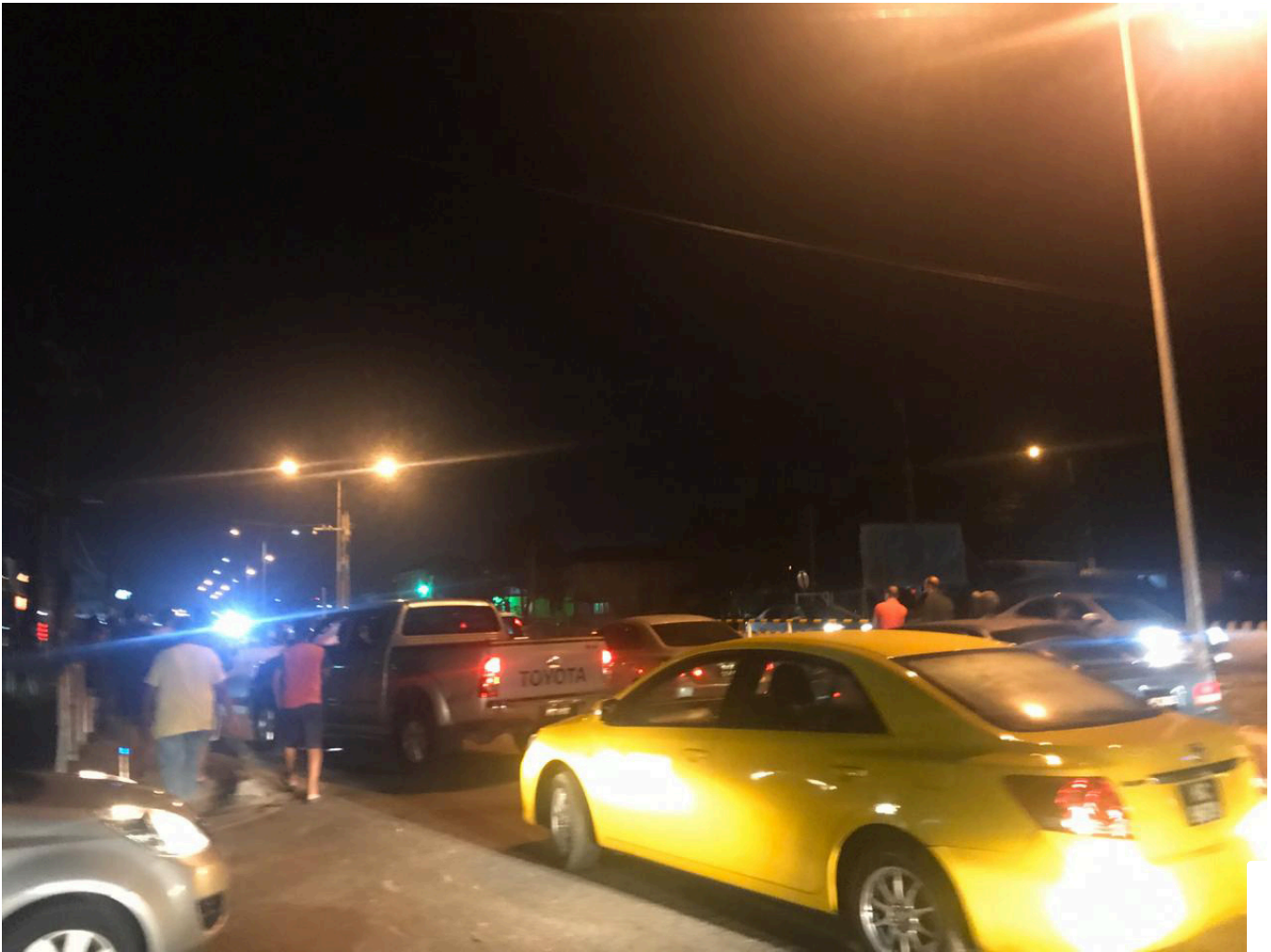
A congested traffic scene along the Providence Public Road, where a second road block was erected.