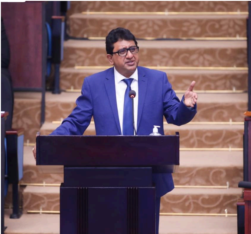
Attorney General and Minister of Legal Affairs, Mohabir Anil Nandlall, SC

"The nine publications made by the Defendant that have been complained about in these proceedings have seriously and irreparably damaged and are likely to continue to seriously and irreparably damage, the reputation and standing of the Claimant among his Cabinet colleagues, his political peers and indeed all right-thinking members of society in Guyana, the Caribbean and throughout the world," the document said.