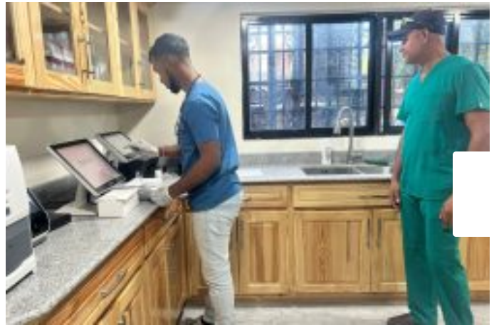
State-of-the-art animal care hospital to offer services here soon 19 h ago