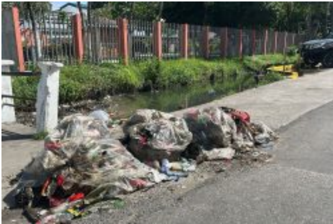
City still plagued with unsightly garbage accumulation 19 h ago