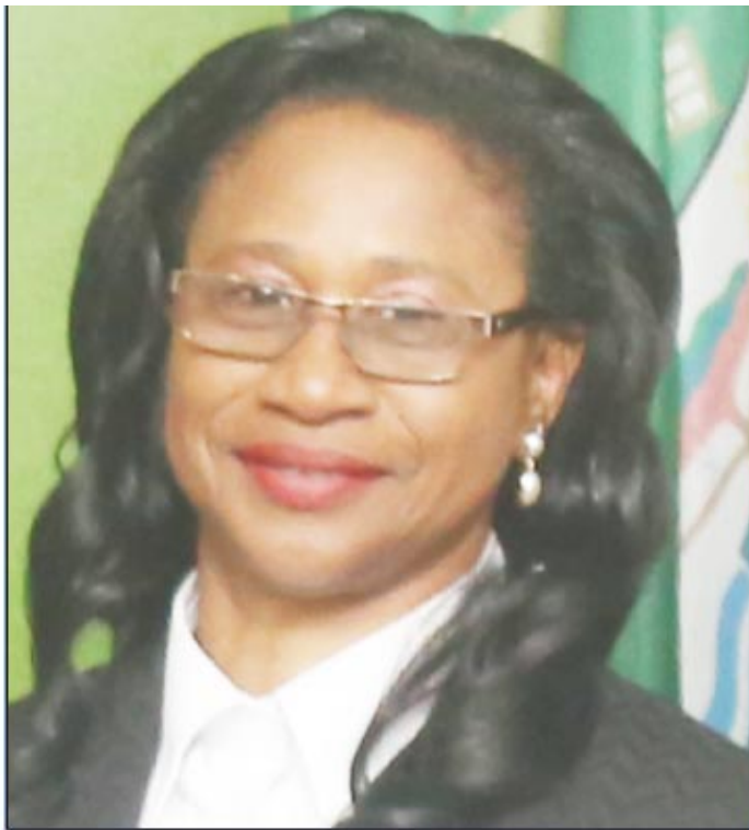
Justice Yonette Cummings-Edwards