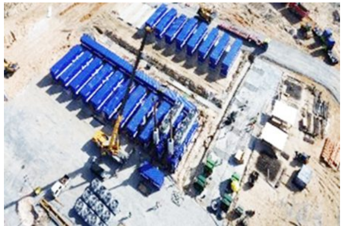
GPL in dispute with Honduran generators company 19 h ago