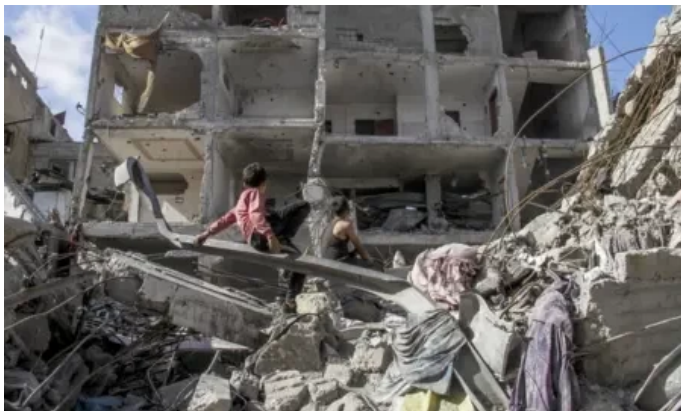
Hamas and Israel edge towards ceasefire deal as Israeli strikes in Gaza intensify 5 h ago