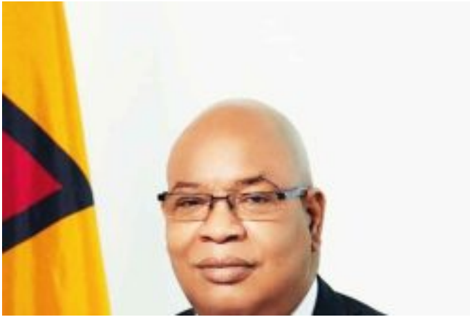
Differently-abled persons to have their own buses – Edghill 19 h ago