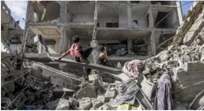
Hamas and Israel edge towards ceasefire deal as Israeli strikes in Gaza intensify 4 h ago