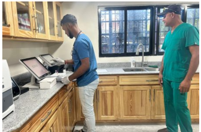
State-of-the-art animal care hospital to offer services here soon 18 h ago