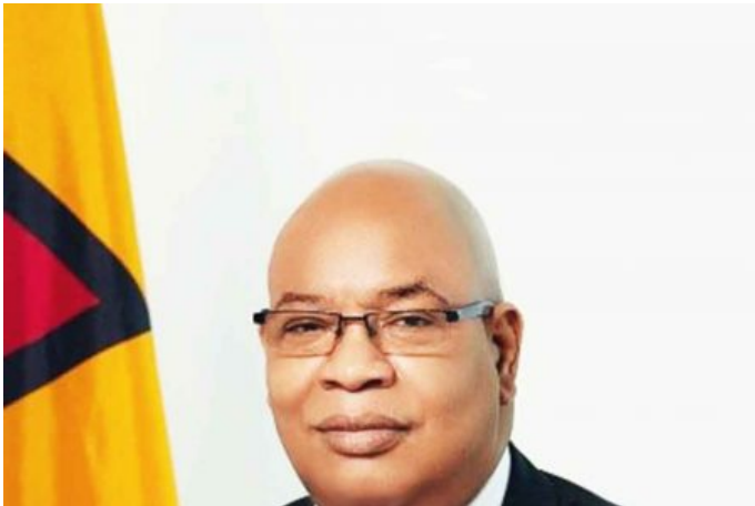
Differently-abled persons to have their own buses – Edghill 18 h ago