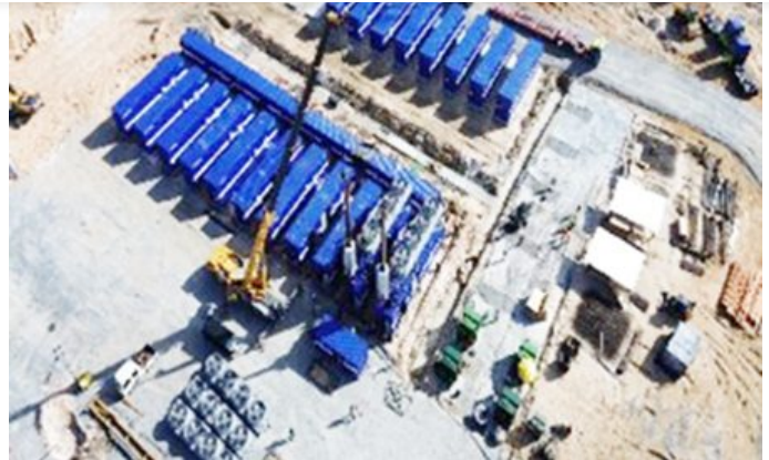
GPL in dispute with Honduran generators company 18 h ago