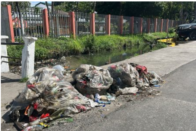
City still plagued with unsightly garbage accumulation 18 h ago