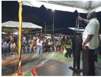
Opposition Leader Aubrey Norton addressing supporters at the Burnham Basketball Court.