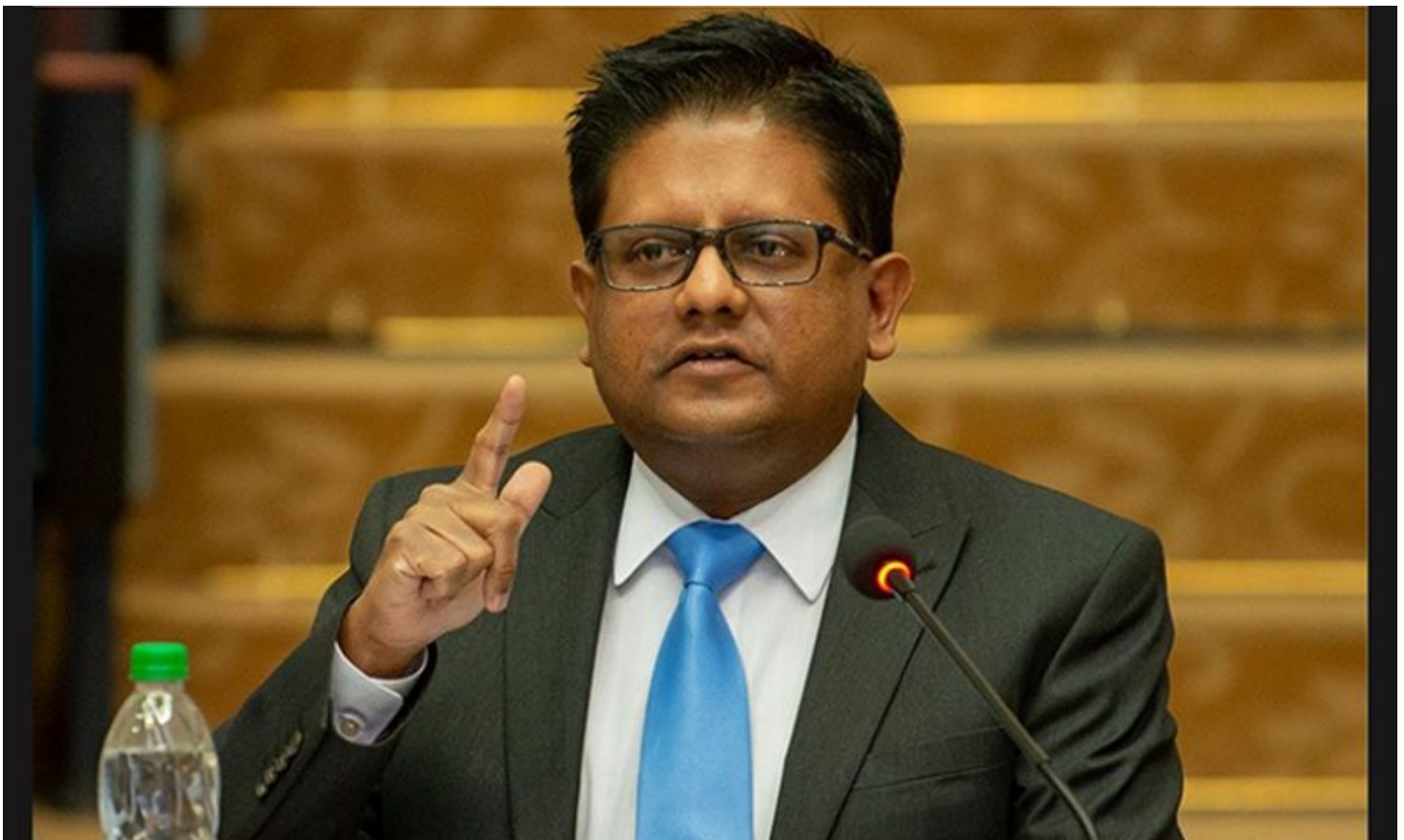
Senior Minister in the Office of the President with responsibility for Finance, Dr. Ashni Singh