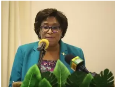
AFC Chairperson, Catherine Hughes

Kaieteur News – The Opposition is being warned against boycotting Parliament today where a $44.7B supplementary budget by the government is to be considered.