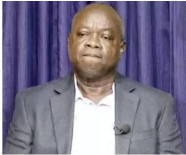
Opposition Leader, Aubrey Norton