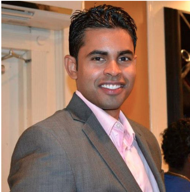
Minister of Sport Charles Ramson Jnr.,