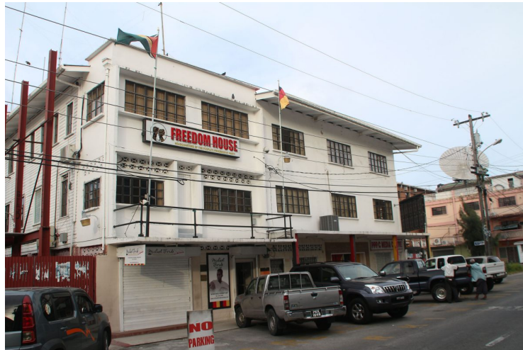
PPP's Freedom House