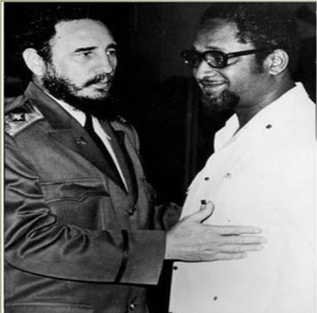
Prime Minister Forbes Burnham with President Fidel Castro Circa 1970's

These were all declared to be political actions that were strategic to the protection of the nation's