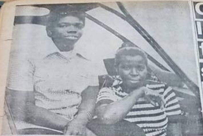
THESE TWO teenage girls have become the first women to train as helicopter pilots at the Oxford Air Training School, Kidlington.