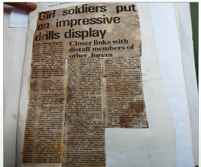
Historical Article Women's Inter –Service Drill Competition Guyana Chronicle 1978

In the end the six women who successfully completed Course Six demonstrated that females should be allowed to prove themselves based on their abilities and not their gender.