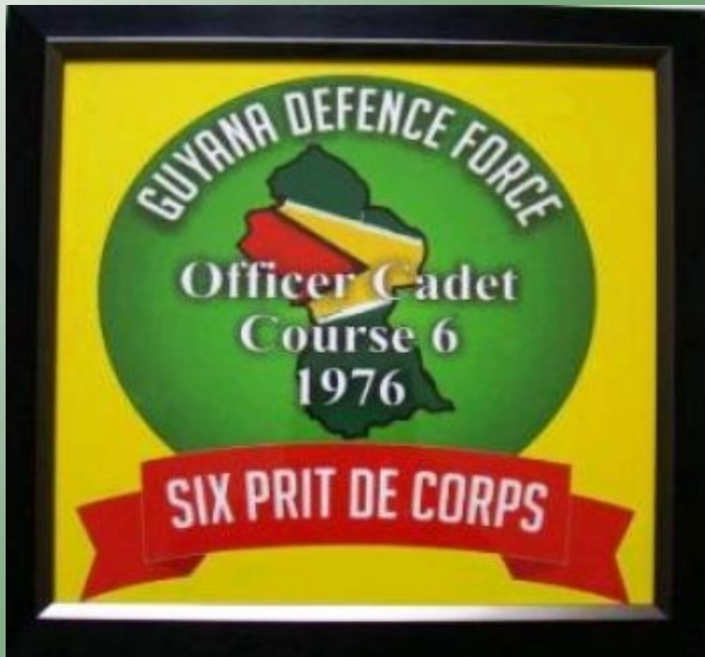
Adopted Course Insignia GDF Standard Officer Cadet Course Six 1976