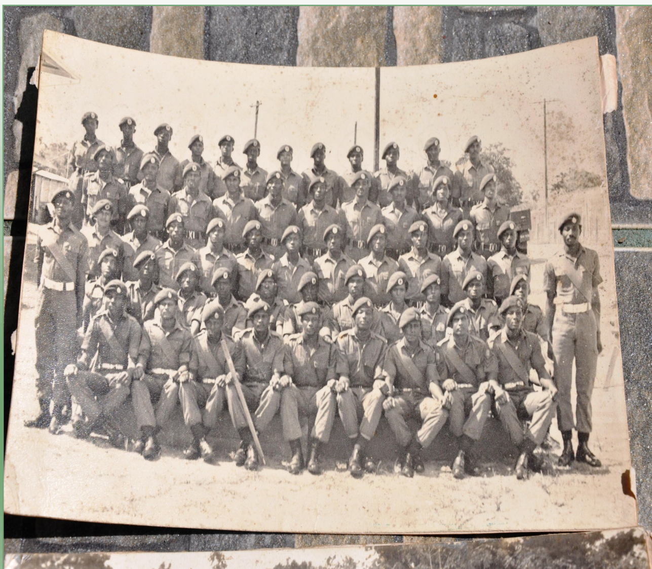
Standard Office Cadet Course Six 1976